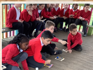
Year 4—Firing Catapults

Please remember our furry friends are not allowed on school site. We also ask that you do not leave dogs tied up outside of school as not everyone is comfortable with dogs.