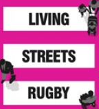
LIVING STREETS Rugby local group of UK charity promoting walking