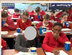
Year 6—Soup Tasting

If children are bringing phones into school they are required to hand them into the class teacher at the start of the day. The class teacher will then give the phones back to the children at the end of the day. Children should not be using phones when at school. This includes those in after school clubs run by us and by outside companies.